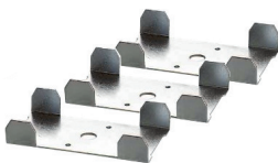
Stud Foot Brackets