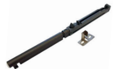
Softclose 80kg Capacity