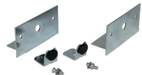
Joint Kit For Double Pocket Doors